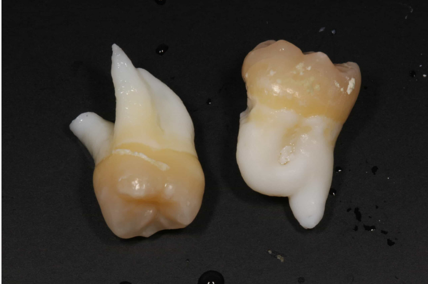
Extracted Wisdom teeth that caused a gum infection